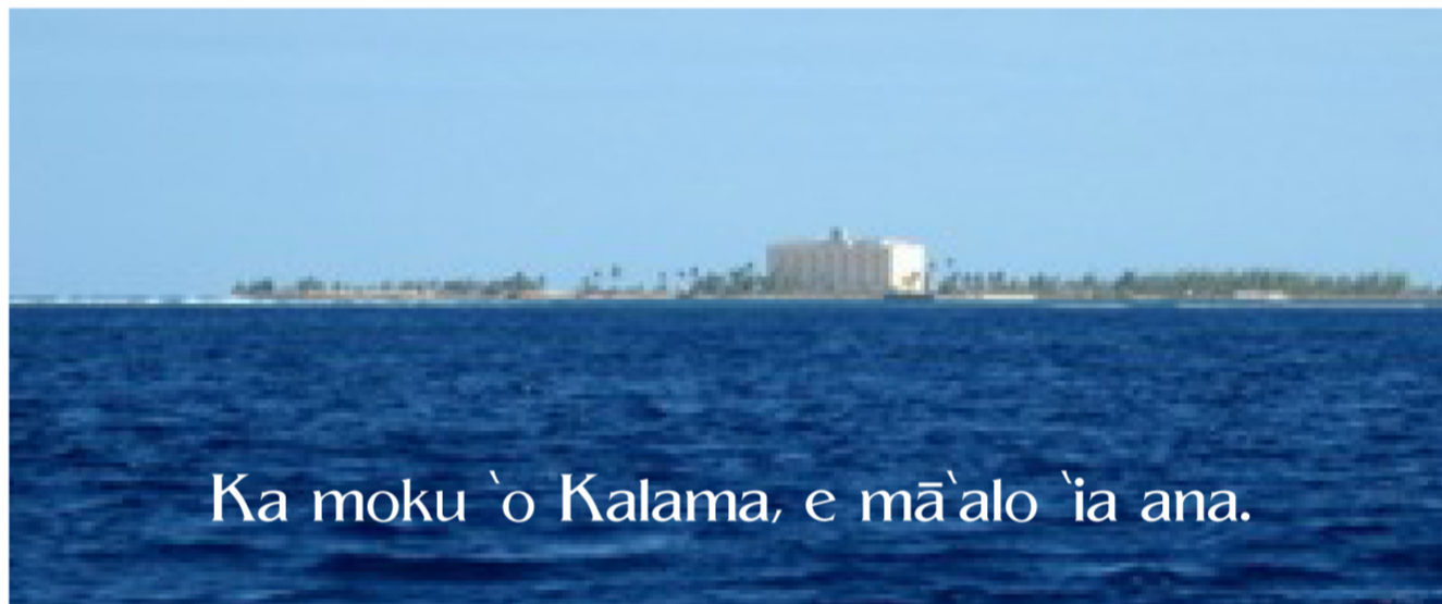
Ka moku 'o Kalama, e mā'alo 'ia ana.

Mai noho 'oe 'eā a no'ono'o iki, ua pae ka wa'a. 'A'ole loa. Ua lawa nō ke kūmaka ka 'ikena. 'Oiai, 'o kēia 'āina a ka haole e kapa aku ai i ka inoa 'o Johnston Atoll, he 'āina piha i ka mea 'ino loa ma ka honua. Kau akula 'o 'Amelika i nā mea pākī nukelea