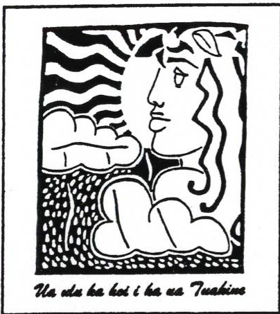
Hui Aloha 'Aina Tuahine